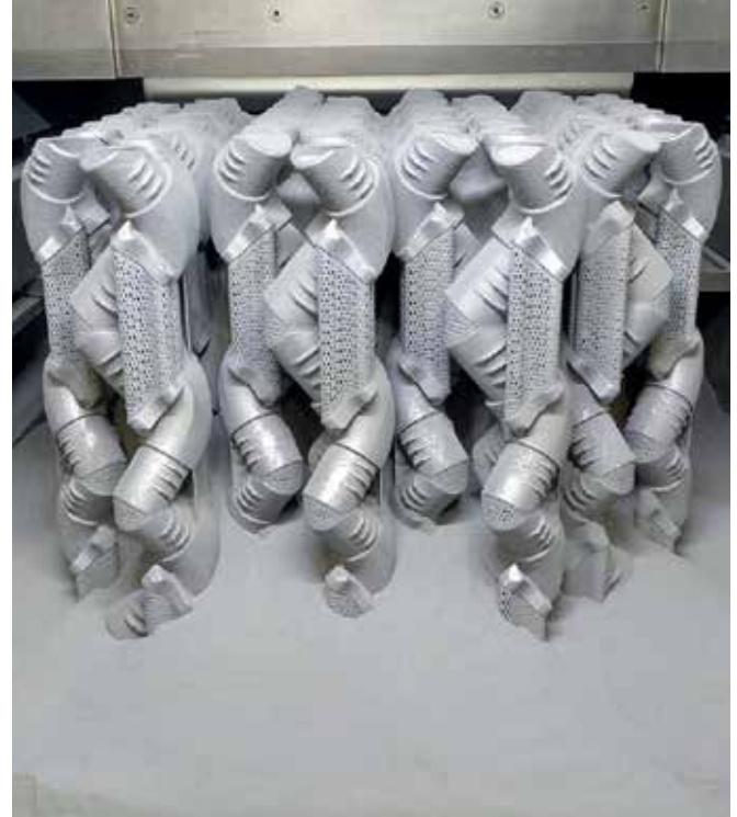
Fig. 5: 120 stacked, nested connectors printed in one process on the SLM®280 by Finnish service bureau 3Dstep Oy.